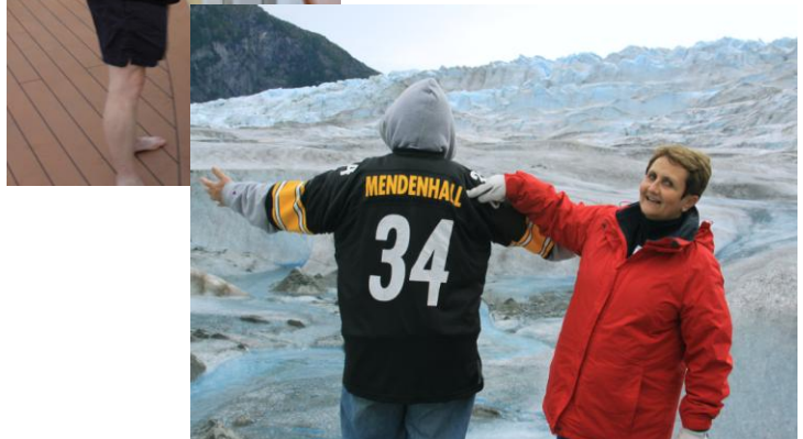
Two Mendenhalls on the Mendenhall Glacier, Juneau Alaska!